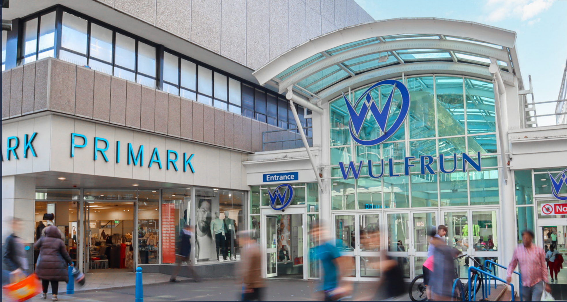
Wulfrun Shopping Centre, Wolverhampton, West Midlands WV1 3HH